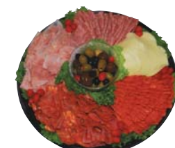
Italian Deli Platter