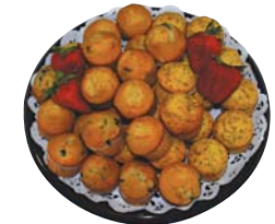
Muffin for the Mornin'