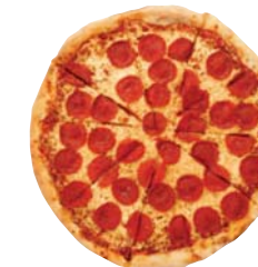
16" round Pepperoni Pizza