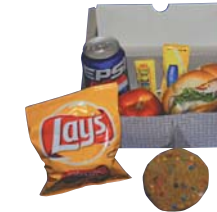
Good to Go