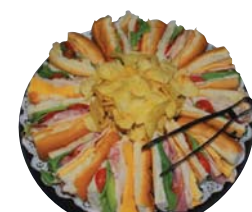
Super Submarine Sandwich Tray